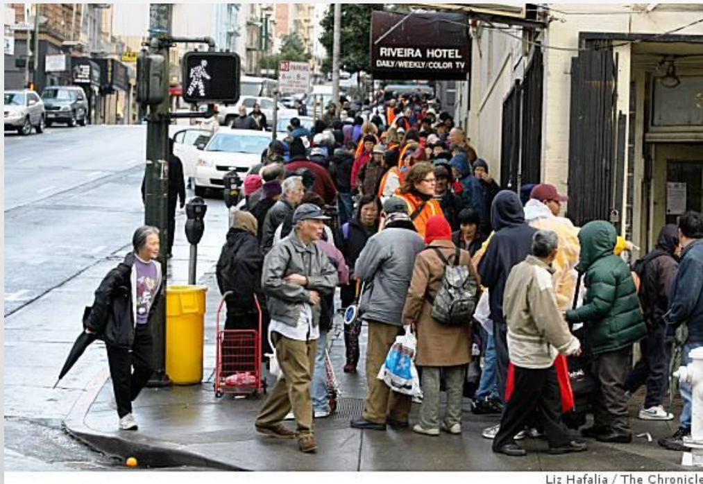
Liz Hafalia / The Chronicle