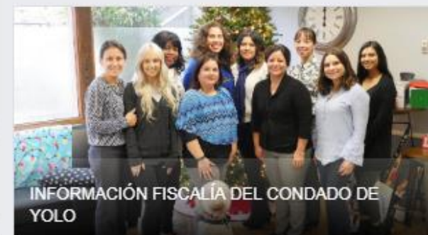
INFORMACIÓN FISCALÍA DEL CONDADO DE YOLO